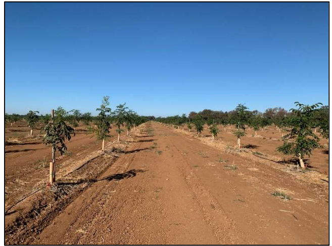
2020 Chandler walnuts.