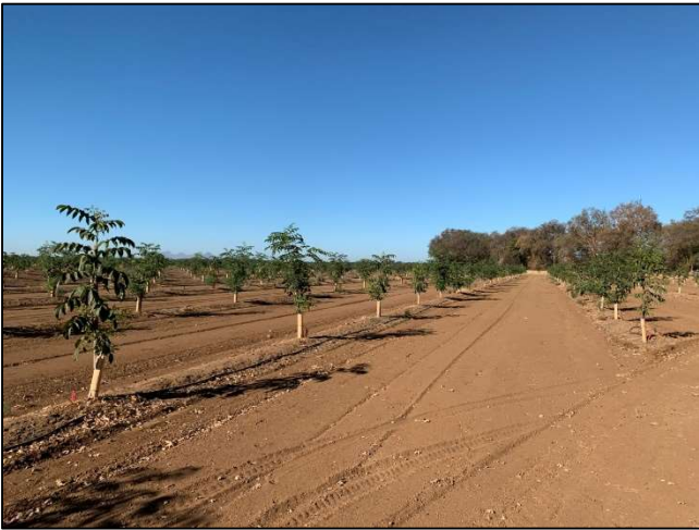
2020 Chandler walnuts.