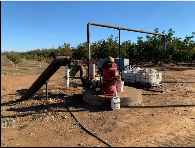
Tile drain irrigation pump.