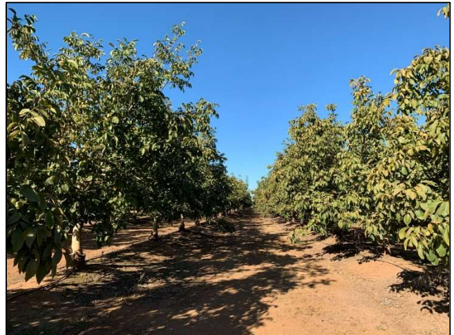
2013 Chandler walnuts.