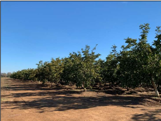
2013 Chandler walnuts.